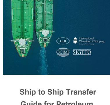
Ship to Ship Transfer Guide for Petroleum, Chemicals and Liquefied Gases Second Edition