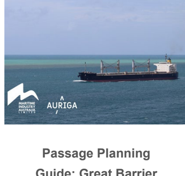
Passage Planning Guide: Great Barrier Reef and Torres Strait (2026-27 Edition)