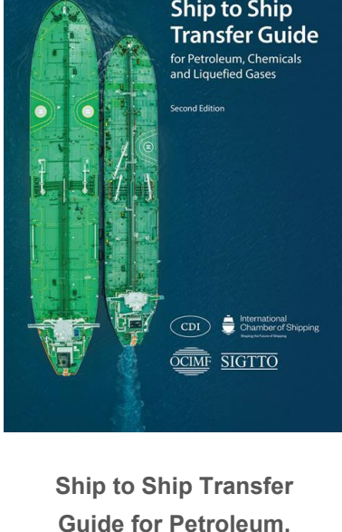
Ship to Ship Transfer Guide for Petroleum, Chemicals and Liquefied Gases – Second Edition