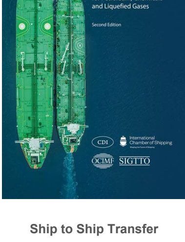
Ship to Ship Transfer Guide for Petroleum, Chemicals and Liquefied Gases – Second Edition