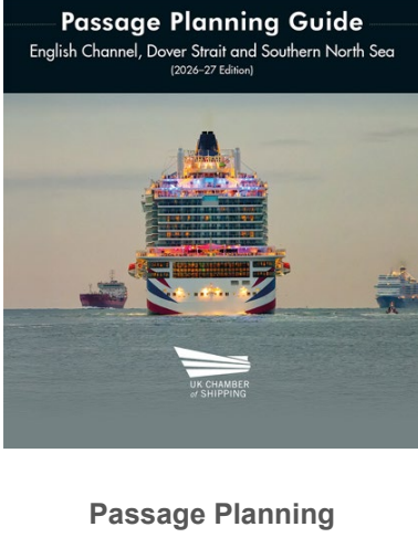
Passage Planning Guide: English Channel, Dover Strait and Southern North Sea (2026-27 Edition)