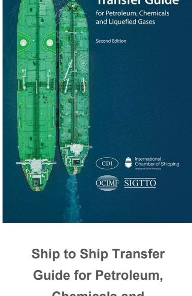
Ship to Ship Transfer Guide for Petroleum, Chemicals and Liquefied Gases – Second Edition