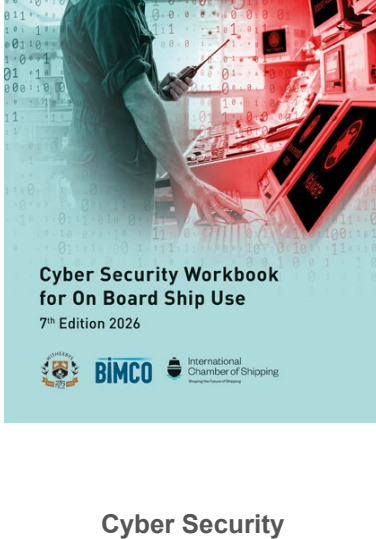
Cyber Security Workbook for On Board Ship Use - 7th Edition 2026