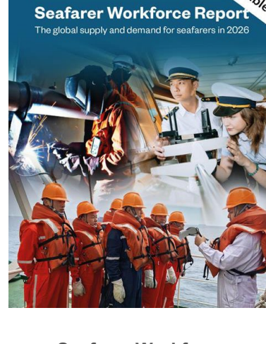
Seafarer Workforce Report - The global supply and demand for seafarers in 2026