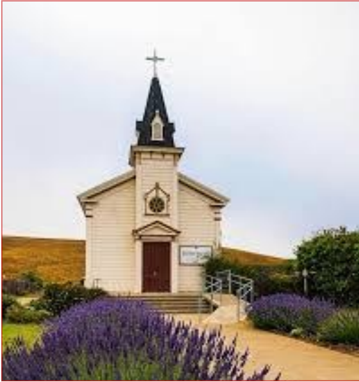
St. ANTHONY'S, in PESCADERO