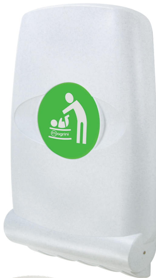
White Fleck Colour Option