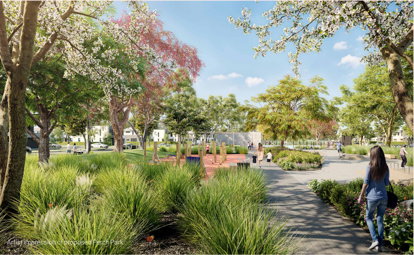
Artist impression of proposed Perch Park

multi-purpose sports courts, ping pong tables, fitness stations, and a skate plaza, enhancing the outdoor experience. Local transport links will whisk you into the CBD, while a short walk takes you to two planned town centres. Construction underway of a government secondary school onsite, and a government primary school and kindergarten in the neighbouring estate, opening from term 1 2026, will add to the already thriving local amenity in Clyde North.