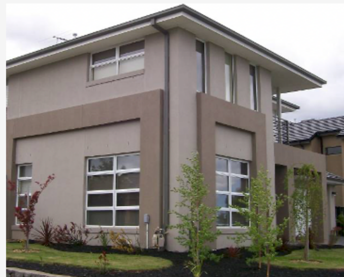
Examples of acceptable corner treatments:

Houses on corner lots and on lots that abut public open space areas must address both frontages (boundaries) through the use of wrap around pergolas, feature windows and other elements that match the front elevation. This treatment must return along the corner elevation to abut the corner fencing. The extension of the required treatment will vary according to the individual design of the house and is at the Guidelines Manager's discretion.