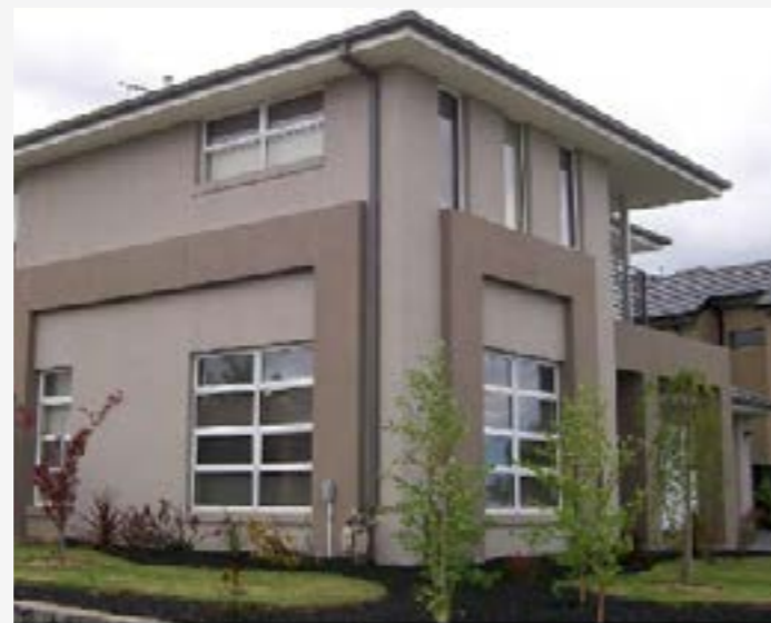
Examples of acceptable corner treatments:

Houses on corner lots and on lots that abut public open space areas must address both frontages (boundaries) through the use of wrap around pergolas, feature windows and other elements that match the front elevation. This treatment must return along the corner elevation to abut the corner fencing. The extension of the required treatment will vary according to the individual design of the house and is at the Guidelines Manager's discretion.