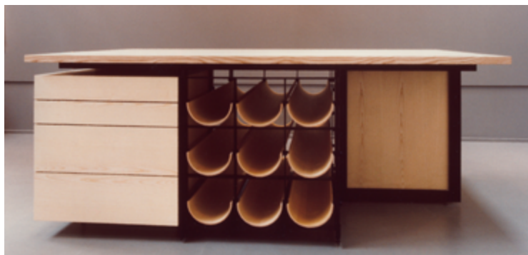
Graduation project "A Tailors table" 1996, Aarhus School of Architecture