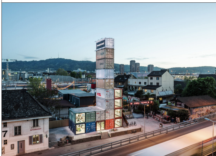
FREITAG Flagship Store Zurich: made of discarded containers.

Nowadays, 220 people are employed by FREITAG lab. ag. Over 30 of them work at the Zurich-Oerlikon headquarters, dismantling, washing, and cutting truck tarps, among other things. The one-off bags and accessories are assembled by long-standing production partners in Portugal, the Czech Republic and Bulgaria. The bags and accessories are available in 30 FREITAG stores, from over 220 retail partners in around 25 countries, and at freitag.ch.