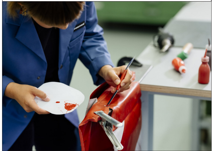
FREITAG has ten repair stations worldwide.