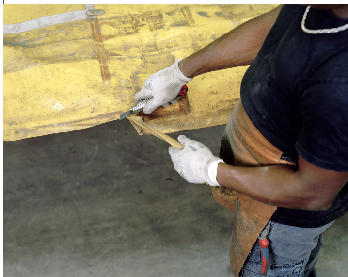
The starting point: used truck tarps as raw material.

For more information and interview requests, please contact: Lena Fisler, lena.fisler@freitag.ch, +41 76 531 29 63