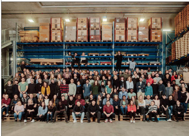
The F-Crew at the factory in Zurich-Oerlikon.