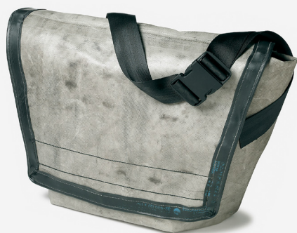
The first prototype from 1993 in the Museum of Design Zurich.