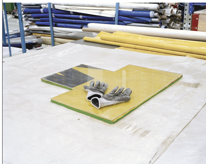
Bags and accessories are cut into one-of-a-kind pieces.