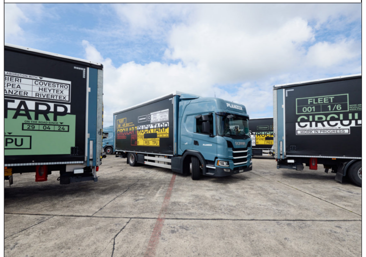
The first truck test fleet with circular tarps.