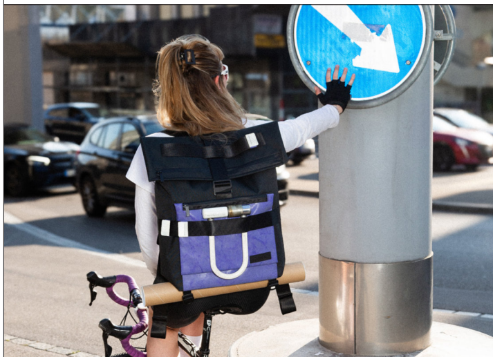
Reflected Bags: More visibility from old truck reflectors.