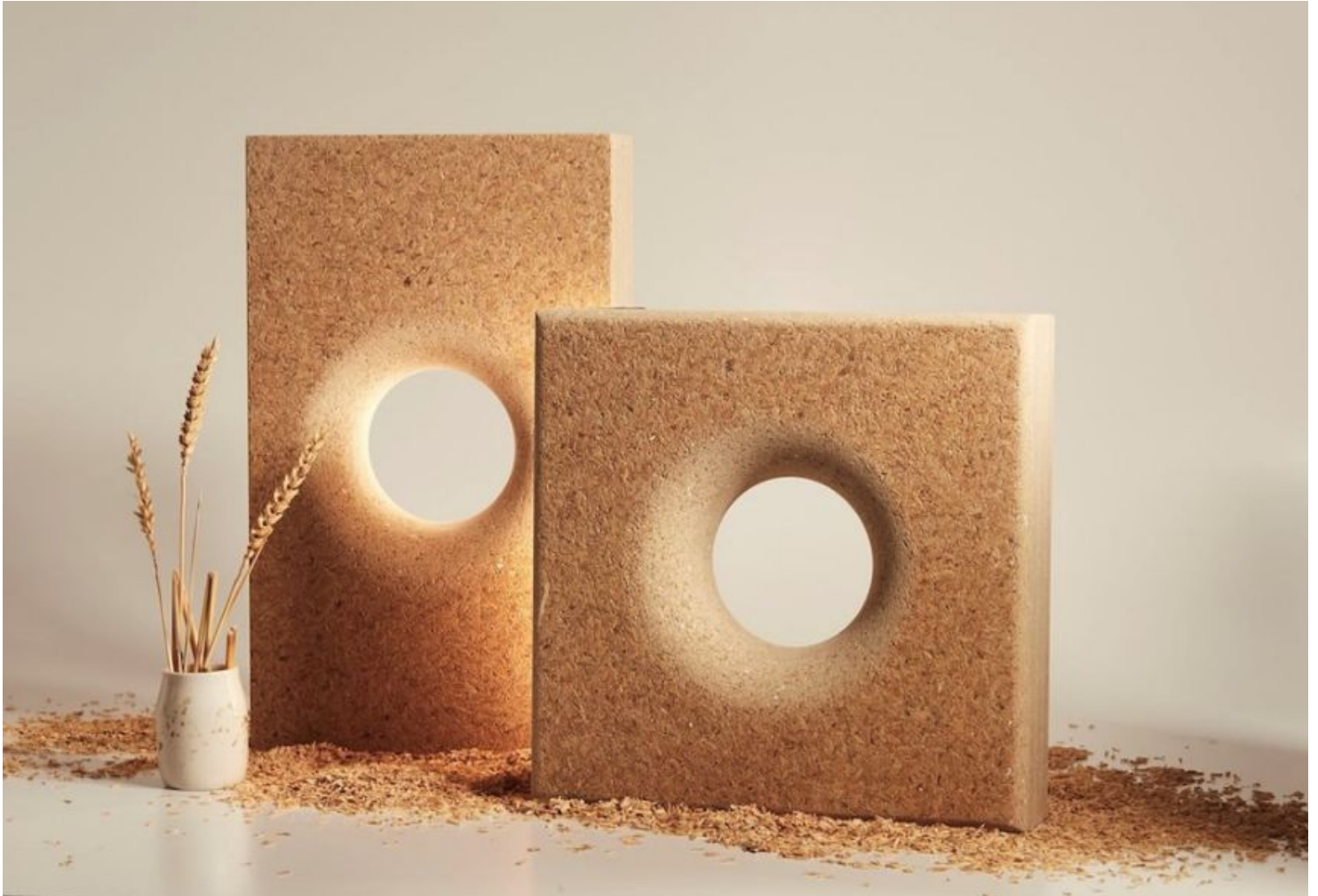
RiceTab by BIRDMIND

Material Matters Copenhagen returns to 3daysofdesign for its second year with an eclectic and international line-up.