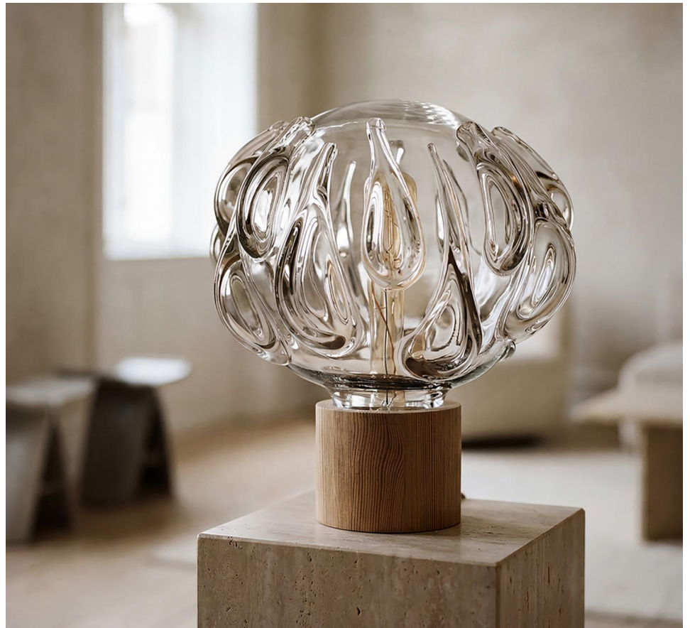
Jo Andersson Studios

Swedish design outfit Jo Andersson Studios creates expressive hand-blown glass objects. The practice launches Drippy, a sculptural lighting collection combining hand-blown glass with solid wooden bases. The pieces are captured at the exact moment molten glass begins to move and drip, creating a contrast between the fluidity of glass and the warmth of natural wood.