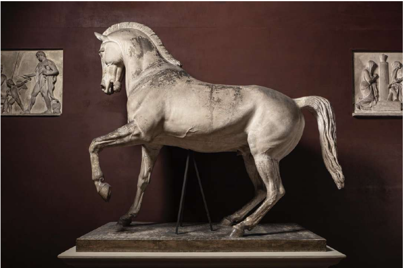
The Monument of Prince Józef Poniatowski in the courtyard in front of the Presidential Palace, designed by Bertel Thorvaldsen.

“This story naturally led me to the horse motif which felt like a poetic direction for the lace piece.”