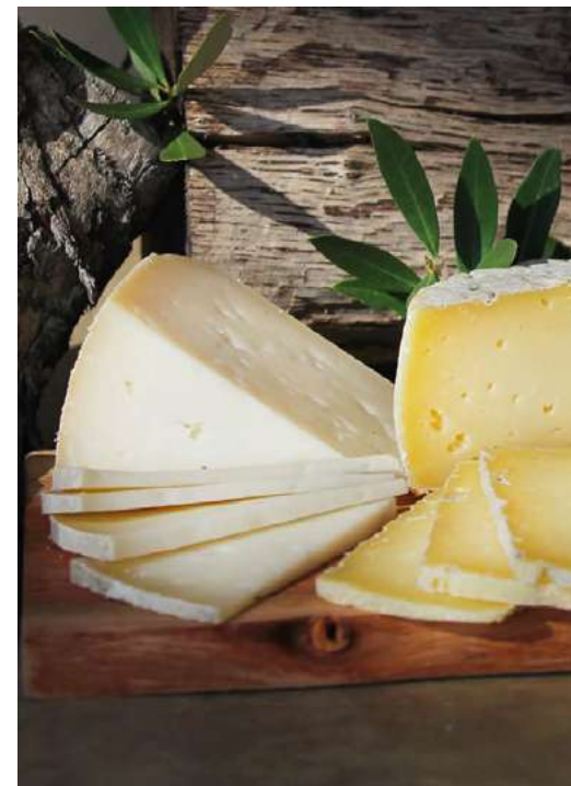
L'Aubreda Artisan Cheese - La Vall de Llèmena (Girona).

They craft organic wines that tell the truth of a unique landscape, shaped by the wind, the light and the tramontana. Each bottle reflects the passion of a team that loves its craft and works in harmony with nature.