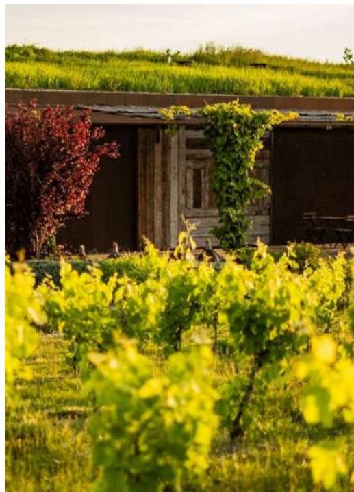
Clos de Basella Winery / L'Empordà (Girona)

Within Mediterranean Dialogues, this dimension completes the narrative. It grounds design in reality, connecting objects with the culture that surrounds them. Because to truly understand the Mediterranean, you don't just observe it, you sit at the table and become part of the conversation.