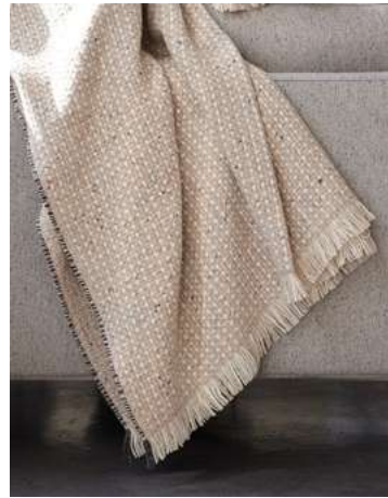
Zeit Maxi Throw Designed by Teixidors

The hand-combed yak wool, sourced from nomadic cooperatives in Mongolia, meets local merino to celebrate the raw beauty of natural fibers. Gobi is a tribute to movement and material integrity, crafted for those who seek comfort rooted in the purity of the landscape. Available also in dark and light grey, these shades emerge directly from the raw material, capturing the natural essence of the fibers without the need for dyes.