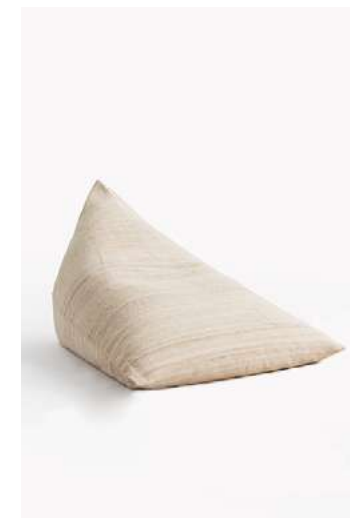
Moeen puffs Designed by Cumellas

Folia collection explores the subtle play of textures, creating rugs that are discreet and timeless. Cut pile and loops form delicate reliefs, highlighted by a uniform color that acts as a neutral backdrop, letting the material itself take center stage. Made from carefully treated nettle, each rug preserves the natural qualities of the fiber, resulting in a durable, resilient, and unmistakably tactile surface. Every piece is hand-knotted in India using artisanal techniques that ensure precision, quality, and uniqueness. The process is thoughtful and responsible, with only the necessary material dyed for each rug to minimize waste. Conceived like a work of tailoring, Folia rugs are made to measure for each space. Their essence lies in the union of carefully crafted natural material, meticulous hand-knotting, and a design where texture becomes the defining element.