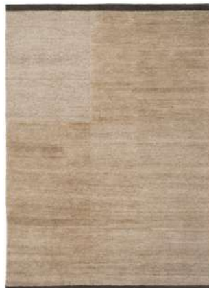
Folia Designed by Cumellas

Calma collection is knotted in New Zealand wool. We wanted to emphasize the link between its irregular perimeter and the center of the rug, the use of tone-on-tone color together with the difference in height of the pile. This rug stands out for the high quality of this material. The result is a neutral piece that transmits a serenity that harmonizes any environment. Calma is handmade by expert weavers in northern India, with a density of 100,000 knots/m 2 . Craftsmanship is present throughout the entire process, giving an intangible value to the piece. It is made with New Zealand wool, a clean white wool, which has been hand dyed in the 8 colours of the collection.