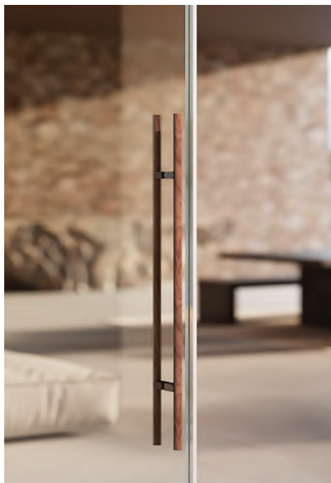
Kumo Wood / Designed by Ilja Huber

Kumo , meaning cloud in Japanese, is conceived as a light and elevated gesture within the space. Designed to enhance cabinets and doors through pure material expression, it places wood at the center, balanced by the precision of metal.