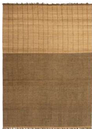
Terra Designed by Cumellas

The Moeen Pouf is hand knotted with chobi wool. Its confection is completely handmade, its fabric is resistant and durable thanks to the properties of wool. It can be made with the same color palette as the Batura rug collection and the design allows us to use two colors, one on each side, making them reversible or a single-colour fabric. The size is 95x150x100cm, making it perfect to place in any space, Moeen is a relaxed seat as well as providing comfort and calm.