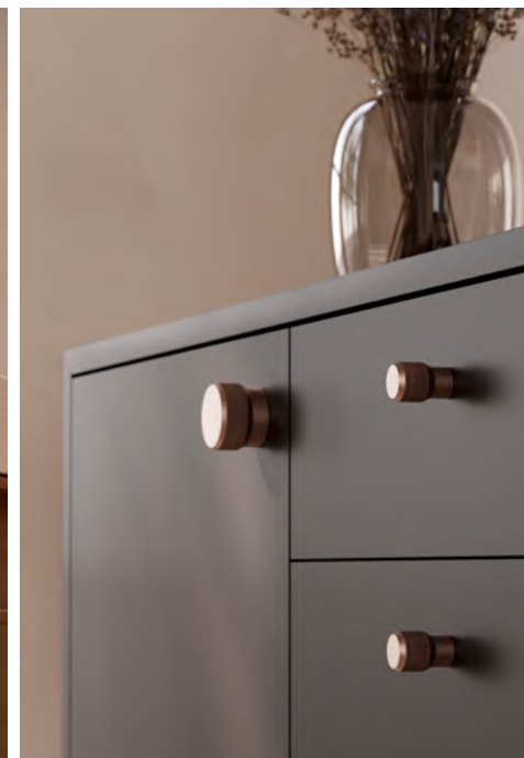
Brooklyn Series / Designed by Steffensen&Würtz

Conceived as a complete architectural hardware series, including door handles, knobs and cabinet handles, wall hooks, door stoppers, and pull handles, Fase brings coherence and strength to every element. Available in a curated selection of exclusive finishes and multiple dimensions, it adapts seamlessly across applications while maintaining a clear and enduring identity.