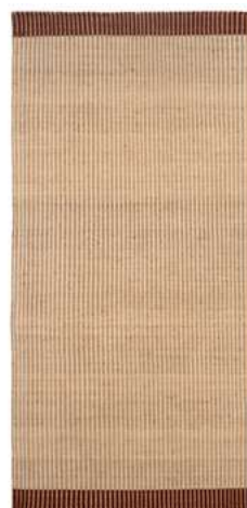
Tatam Designed by Cumellas

Designed by Cumellas, Terra rug is handwoven in jute. Two natural tones structure the surface, subtly dividing the rug while allowing the fiber's irregular texture to remain visible. Wool appears intermittently in contrasting colors, emerging and fading as it integrates into the warp. These vertical lines create a discreet relief, shaped by the material and the weaving process itself. The design does not follow a fixed pattern, but responds to the rhythm of the loom and the weaver's hand, making each piece unique. Inspired by plowed fields and the relationship with the land, Terra reflects a deep respect for craftsmanship, time, and manual labor. Each rug is the result of an honest dialogue between material, technique, and natural imperfection. Available in four carefully selected natural tones, conceived to contrast quietly while retaining an earthy character.