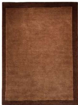
Calma Designed by Estudi Manel Molina

Calma collection is knotted in New Zealand wool. We wanted to emphasize the link between its irregular perimeter and the center of the rug, the use of tone-on-tone color together with the difference in height of the pile. This rug stands out for the high quality of this material. The result is a neutral piece that transmits a serenity that harmonizes any environment. Calma is handmade by expert weavers in northern India, with a density of 100,000 knots/m 2 . Craftsmanship is present throughout the entire process, giving an intangible value to the piece. It is made with New Zealand wool, a clean white wool, which has been hand dyed in the 8 colours of the collection.