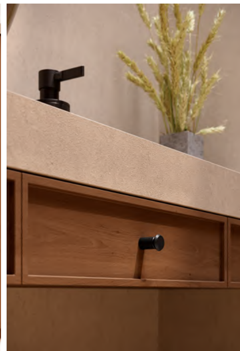
Fase Series / Designed by BUDDE

This subtle yet distinctive detail is expressed across the entire series, from door handles, knobs, and cabinet handles to wall hooks, pull handles, and door stoppers, bringing coherence and identity to every touchpoint within a space.