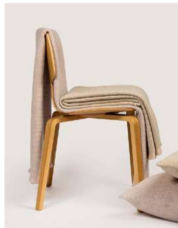
Strata Plaid by John Pawson Designed by John Pawson

Defined by its generous scale, each Nebel piece reflects the physical dedication of the weaver. Handwoven on three-meter looms, production is inherently limited due to the intensity of the process.