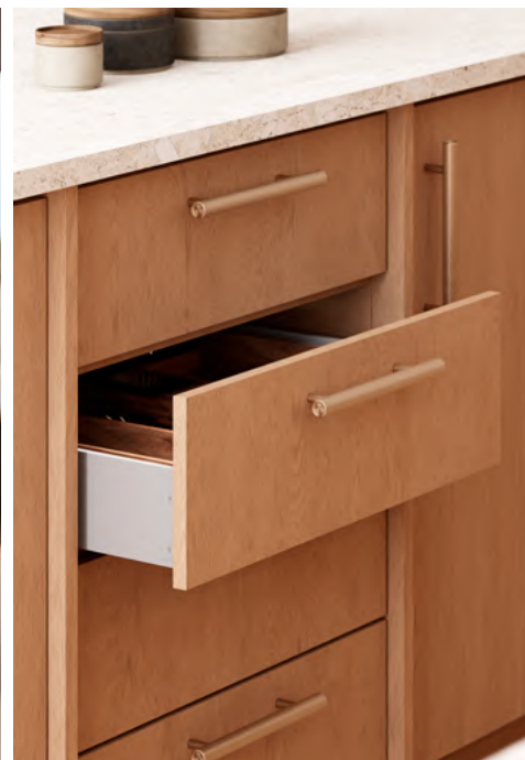
Boto Series / Designed by KASCHKASCH

A versatile range of handles and pull handles for both interior and outdoor applications, Kumo translates Viefe's wood heritage into a contemporary language. Available in three diameters and a curated combination of wood and metal finishes, it offers a refined interplay of warmth, texture, and durability.