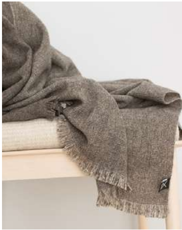
Gobi Throw Designed by Teixidors

Inspired by the spirit of travel, the Gobi collection is designed as a versatile companion for exploration. This lightweight yet warm piece blends ecological baby yak and merino wool to achieve a balance of exceptional softness and durability.