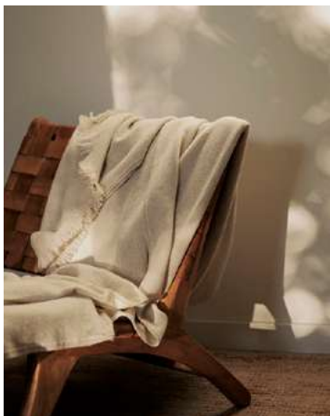
Nebel Collection Designed by Teixidors

Nebel is an exclusive blend of cashmere, merino wool, and baby yak, presented in their undyed, natural tones to reveal the fibers in their purest form. Voluminous yet weightless, it brings a calm, tactile presence to any space.