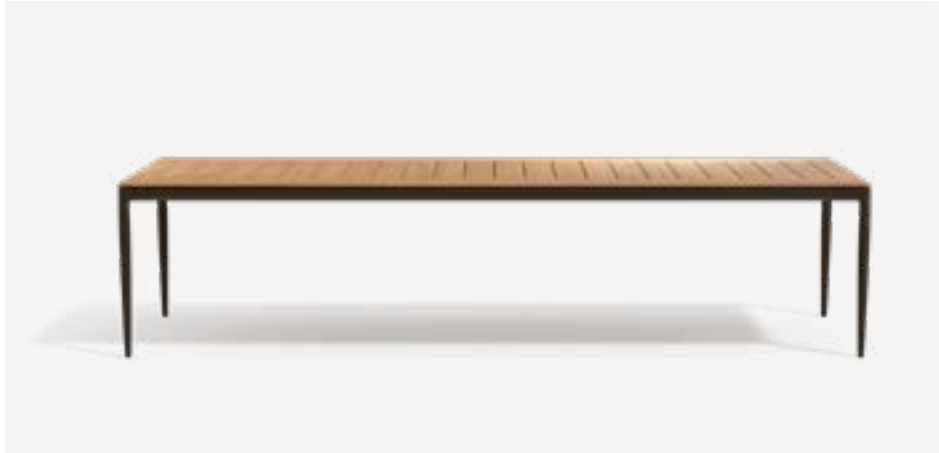
dining table 320 cm / 126"