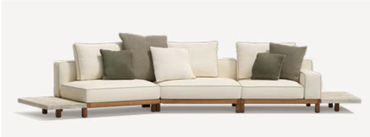
organic sofa with teak frame and travertine or teak sidetable