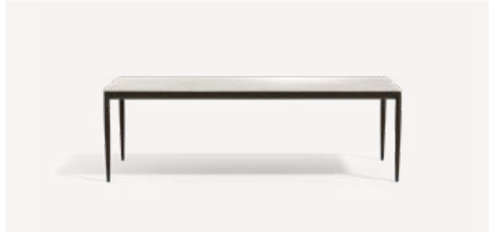
dining table 240 cm / 94.5"