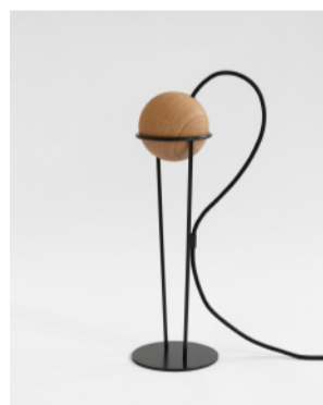
Esfera Table Lamp Jenni Roininen