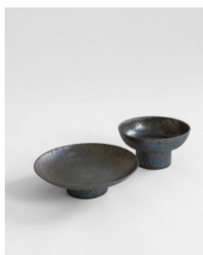
Daiza Pedestals Torafu Architects