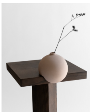
Tumble Vase Falke Svaton