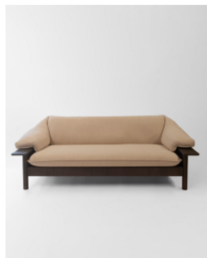
Mangas Sofa (3-seater) Matteo Fogale