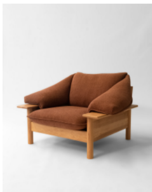
Mangas Sofa (1-seater) Matteo Fogale