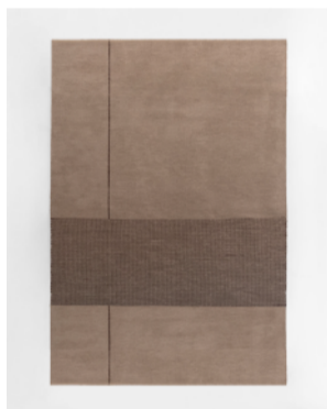
Camada Rug Gabriel Tan Studio