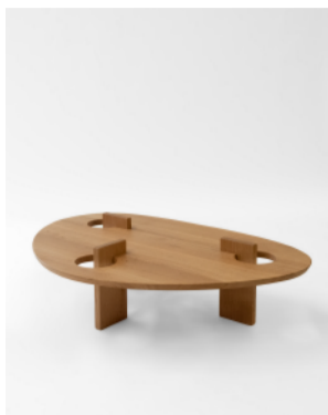
Cenote Coffee Table Falke Svaton