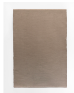
Reta Rug Gabriel Tan Studio