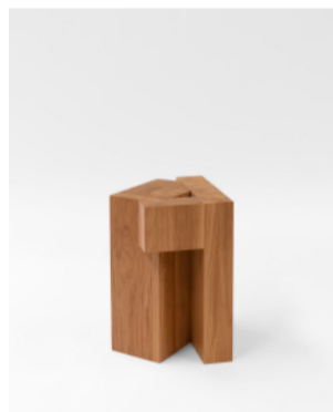
Interlog Side Table Christian Haas