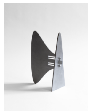
Eixo Sculpture Falke Svaton