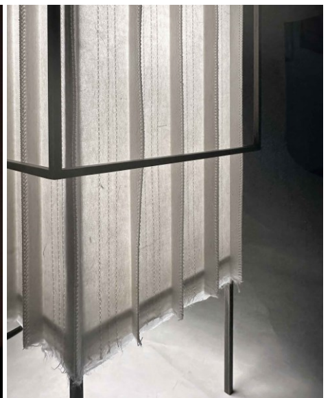
Detail — stitch panel (left) · upper hanji section (centre) · texture close-up (right)