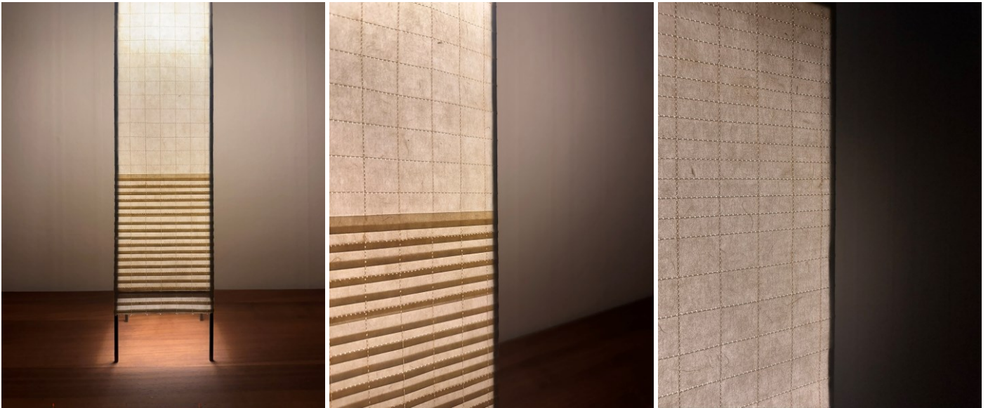
Detail — hanji + stitch panel (left) · light & shadow (centre) · stitch texture (right)