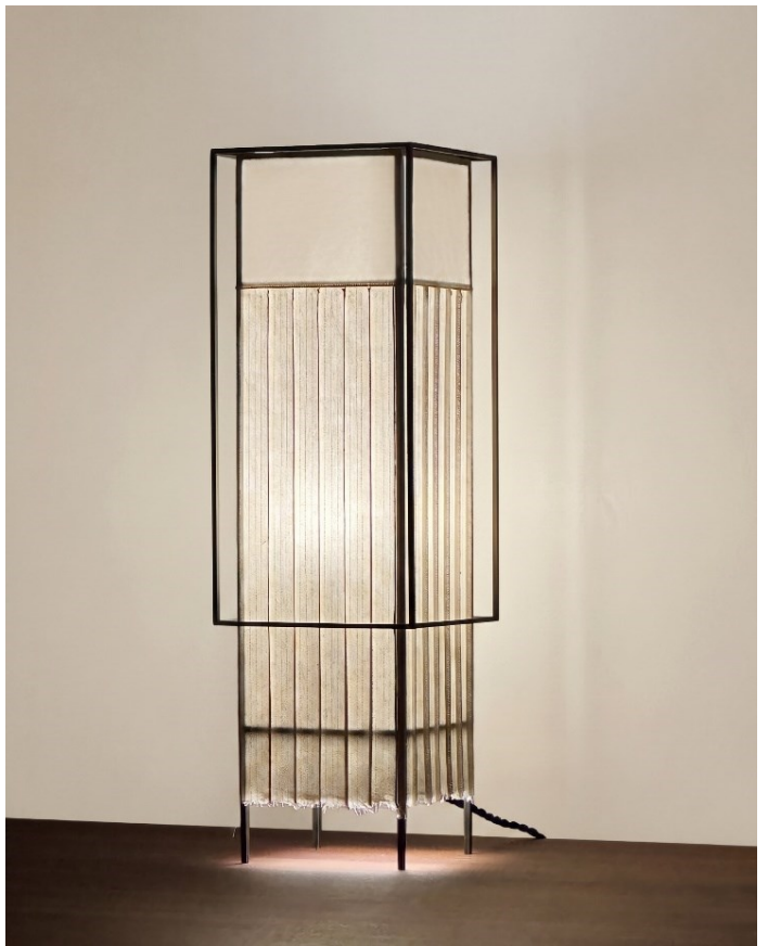
biiit 001 — Front view (left) · Three-quarter view (right)