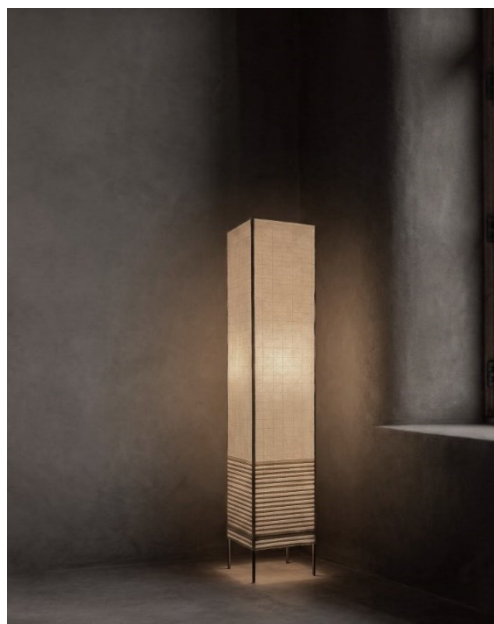
biiit 003 — In-space views