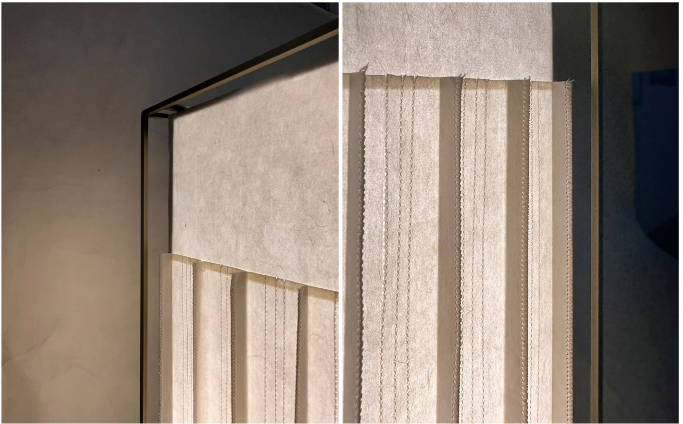
Detail — frame corner (left) · stitch rhythm (right)