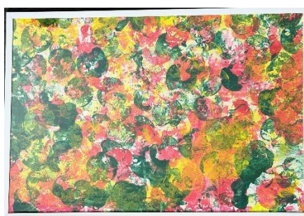
CLASS B1 (THREES)