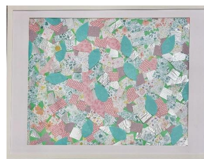
CLASS B5-2T (TWO-DAY TODDLERS)