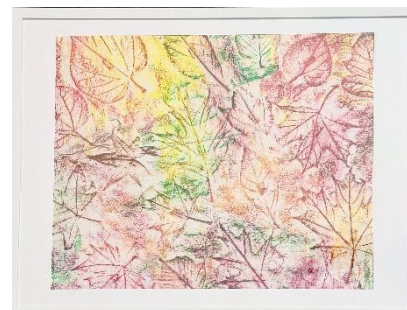
CLASS B3 (THREES)