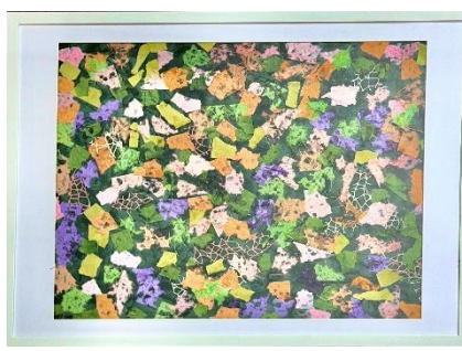
CLASS B5-3T (THREE-DAY TODDLERS)