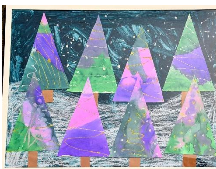
CLASS 102 (FOURS)