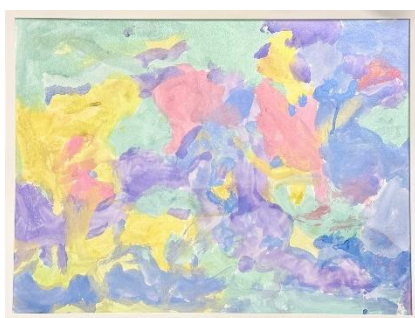
CLASS B2 (FIVE-DAY TODDLERS)