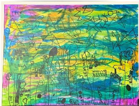
CLASS 203 (FIVES)