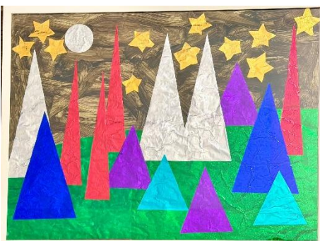
CLASS 103 (FOURS)