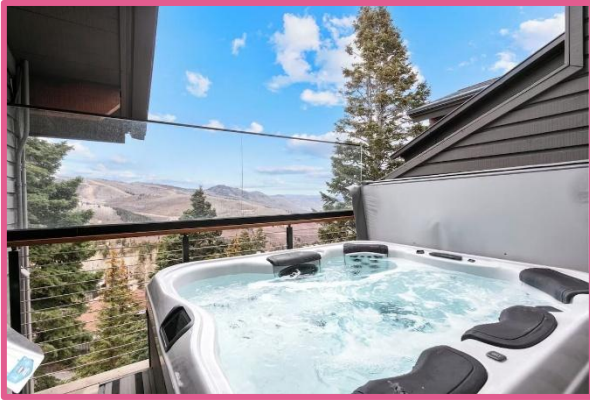
Deer Valley 5 Night Stay (Summer)

There is also a “Fire Sale” for items that had no bids at discounted prices! CLICK HERE to view the items!