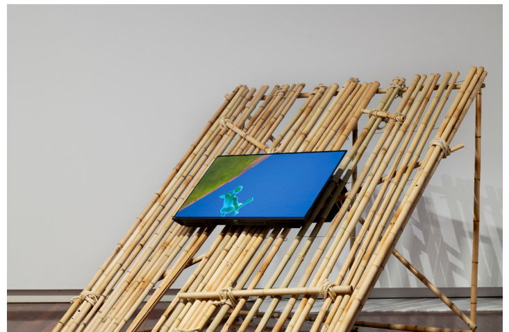
Tiyan Baker, Building a longhouse at the site of the first Bukar Bidayuh settlement , 2025, digital video, sound, bamboo, nuts, bolts, sisal rope, wire. From Fall Damage , Digital Art Program 2024.

https://www.artforum.com/features/web-work-a-history-of-internet-art-2-162477/