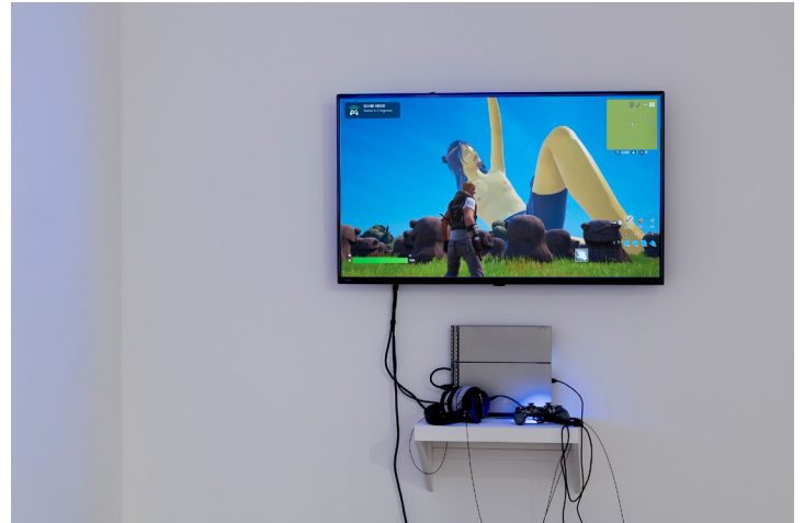
Jason Phu, island of muddled thoughts, season 486 , 2025, video game, PS4, Fortnite Creative map X Unreal Editor in collaboration with Tactical Space.

Commissioned applicants will be notified of the outcomes by 13 October. Unfortunately, feedback cannot be provided to unsuccessful applicants.