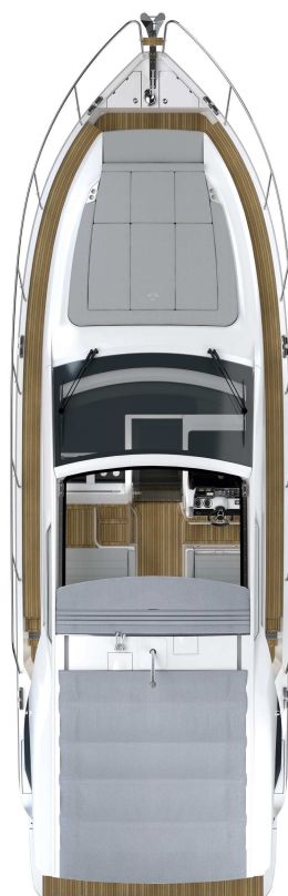
MAIN DECK Option with soft-top