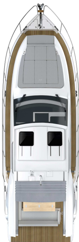
MAIN DECK Standard