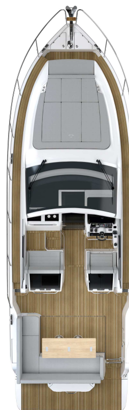
MAIN DECK Option with barbecue at stern, long platform and fixed cockpit table