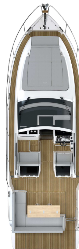
MAIN DECK Option with cockpit table to be transformed into sunpad and extended bathing platform