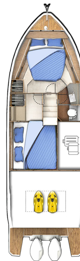
LOWER DECK Option