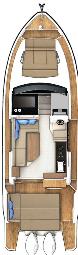
MAIN DECK Option with cockpit table to be transformed into sunpad and extended bathing platform