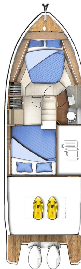
LOWER DECK Standard