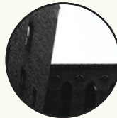
EVANGELIST SUPPORT $12,890.00