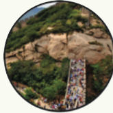
GLOBAL MISSIONARIES $27,080.00