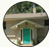
ELEVATE HOPE $10,000.00