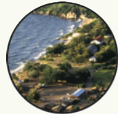
SOM MISSIONS $5,855.00