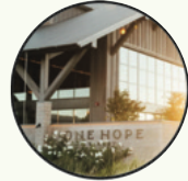
ONE HOPE $10,000.00