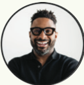
GARDEN CHURCH PLANT CO-OP/MA FARM PROJECT $14,597.00