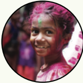
PROJECT 42 $11,228.00