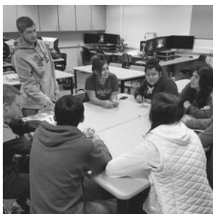
INTEGRATING INTO CLASSROOM