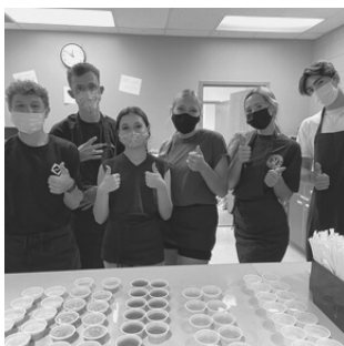
CONNECTING TO BUSINESS