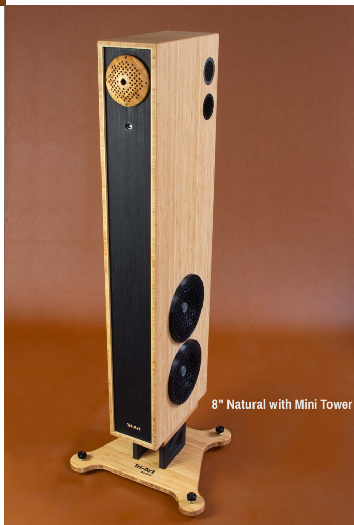
8" Natural with Mini Tower

The included modeling clay isolates and couples the speaker to the plinth, dampens vibrations and keeps setup adjustments easy.