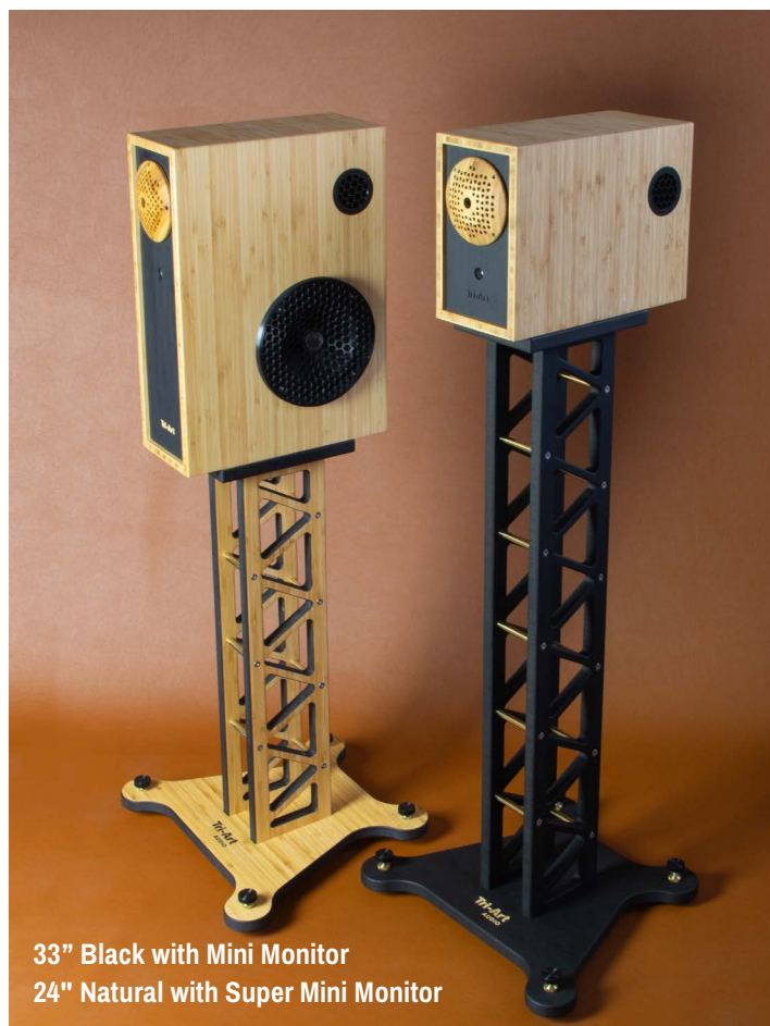
33" Black with Mini Monitor 24" Natural with Super Mini Monitor