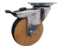
Wooden Castor Available for all Multi-Media racks