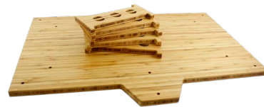
Additional shelf options