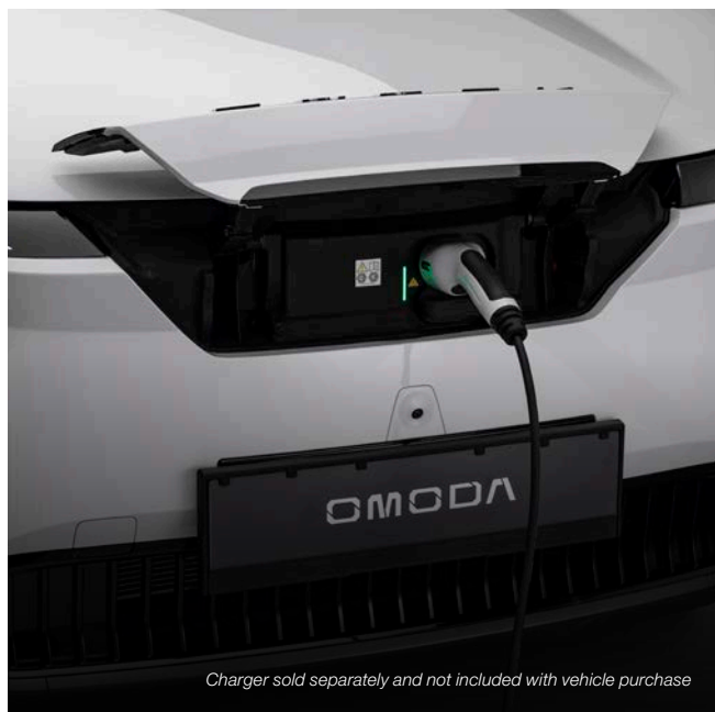
Charger sold separately and not included with vehicle purchase

Electric vehicle supply equipment (IC-CPD / EV trickle charger) not included with vehicle purchase.