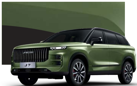
Model Green with Carbon Crystal Black Roof*