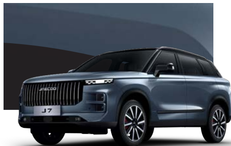
Olive Grey with Carbon Crystal Black Roof*