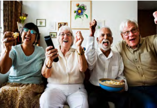
Smart Living for Today's Active Seniors