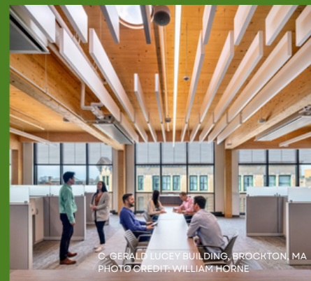
C. GERALD LUCEY BUILDING, BROCKTON, MA