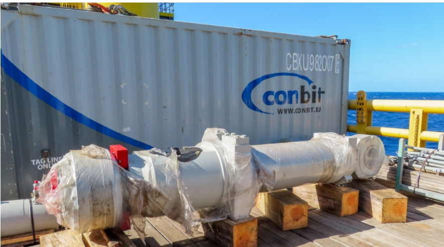
New jack ready for installation