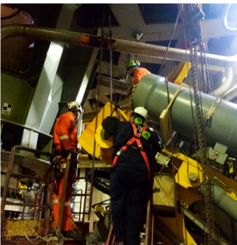
Hydraulic jack being installation