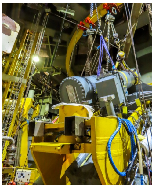
Removal of the old jack

For this project, Conbit worked together with hydraulic jack service company Hydradyne who were responsible for decommissioning the jack. Conbit provided support with all the required lifting jobs, providing all lifting and handling equipment and transferring each part from turret to the reach of the deck crane.