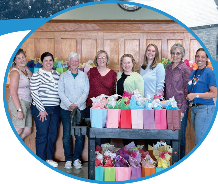
Packing Care bags for the female patients at the Community Care Clinic.

FAITH IN ACTION, BOUNDLESS LOVE, HOPE FOR ALL.