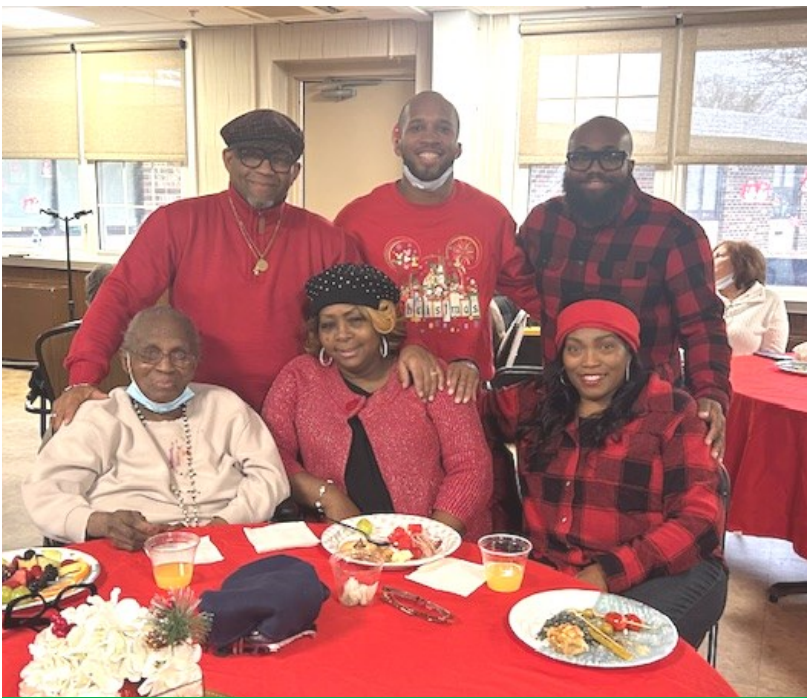
FAMILY ENJOYS CHRISTMAS DINNER ON CAMPUS WITH LOVED ONE