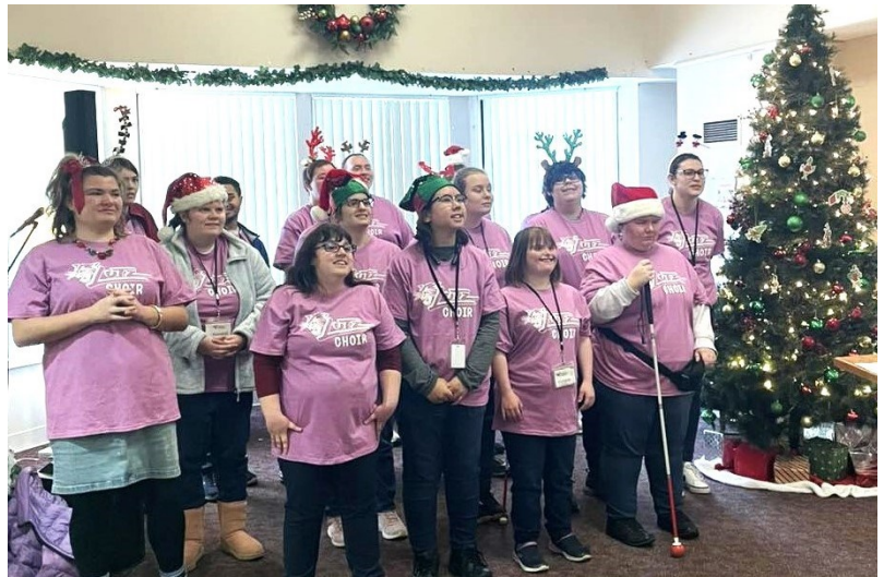
LUTZ SCHOOL CHOIR SINGS CHRISTMAS CAROLS