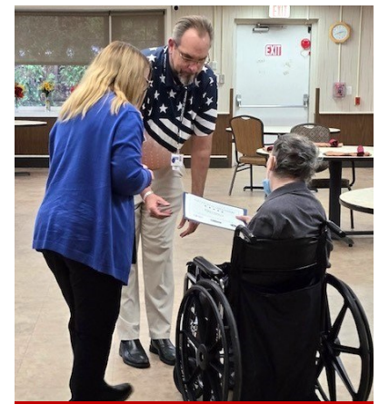
VETERANS HONORING OUR VETS