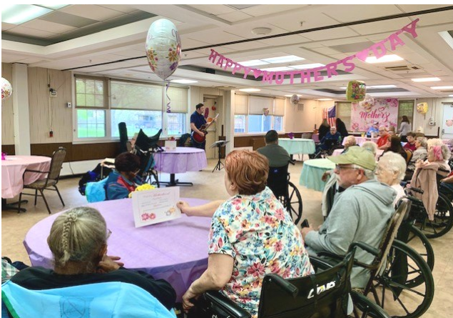
MOTHER'S DAY PARTY FOR RESIDENTS THIS YEAR