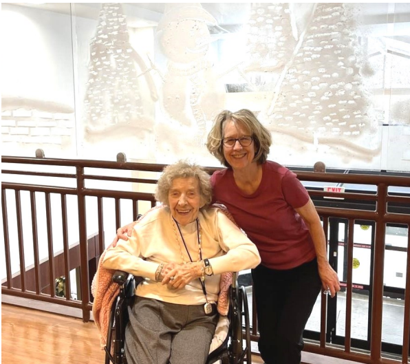
RESIDENT AND DAUGHTER ENJOY PHOTO