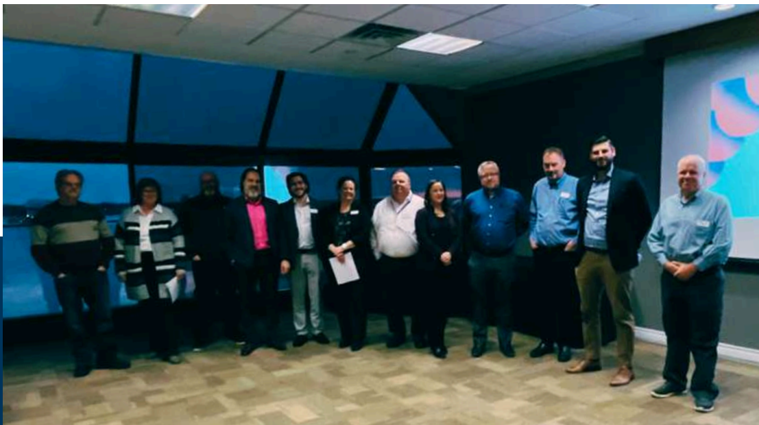
2025 Board of Directors

The Sarnia Lambton Chamber of Commerce convenes, aligns, and advances the interests of our members through policy work, value added business services, and broad engagement to promote a prosperous Lambton County