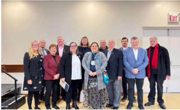
State of Lambton