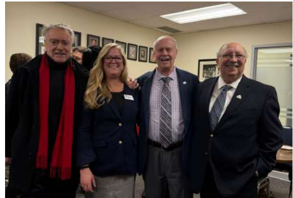
120th Anniversary Open House