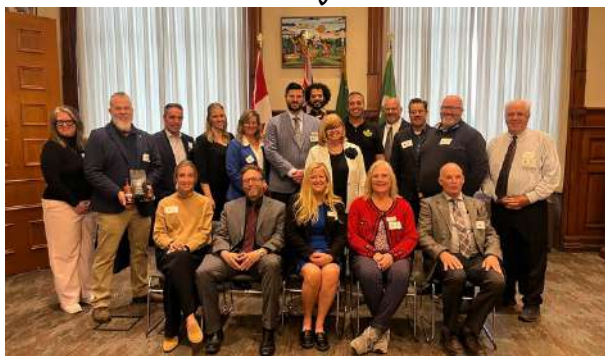
Queens Park Trip