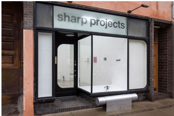
Sharp Projects