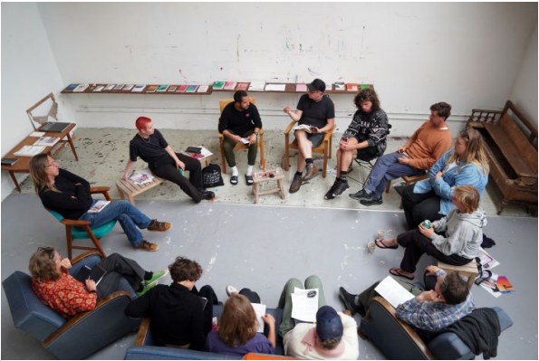
Learning Through the Soles of our Feet by Jubilee, f.eks., Skal Contemporary, 2022

Fawn, 2024 Climbing frame, clay, aluminum, carving, glaze Freeze, 2024 Clay, aluminum, glaze Flight, 2024 Clay, gym rope, glaze Flop, 2025 Climbing frame, carving, aluminium