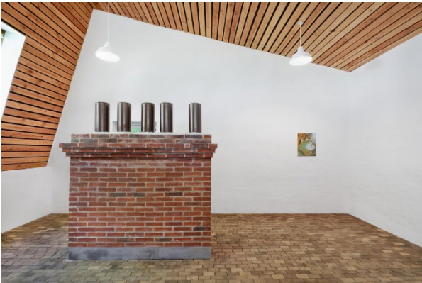
Man In House, 2023, installation view Institut Funder Bakke