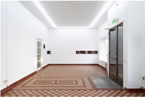
Ksenia Pedan, Sun sinks low , 2025, installation view skēnē, Courtesy of the artist and skēnē, photo: OMN

Asger Dybvad Larsen Six paintings: Untitled (Van Gogh Cover), 2025 All: Mixed media on canvas