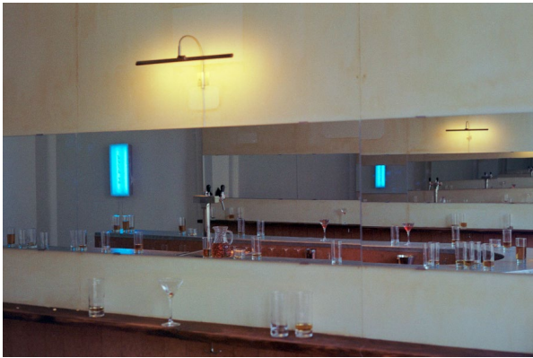
coyote, Deja-Vu , 2023, Courtesy of coyote

coyote (est. 2017) is an artist collective based between Copenhagen and Stockholm.