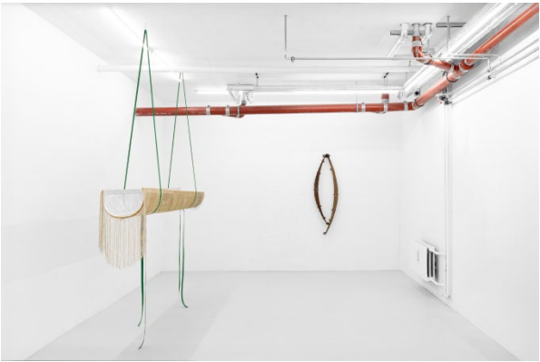
Therese Bülow, Swing Pattern Gone , 2025, installation view Matteo Cantarella

Johan S. Wieth Optimistic Voices , 2025 Performance Optimistic Voices , 2025 Wood, textile, tape recoder