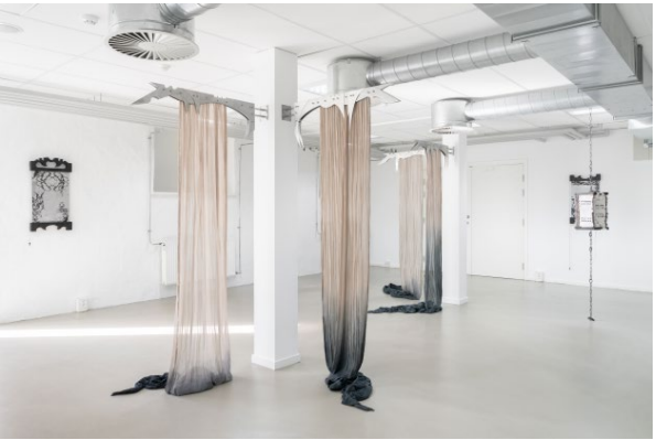
Inside Job, Symmetrical Floundering, installation view Cantina, 2021