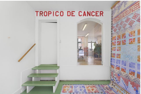
testing elsewheres, 2025, installation view Collega, photo: Brian Kure

Sanna Helena Berger Towards the centre of the field (the new is made comfortable by being made familiar) , 2025 Towards the centre of the field (we are comforted by the perception of sameness) , 2025 Towards the centre of the field (we authenticate the strangeness of these objects) , 2025 All: Particleboard, paper foil, plastic edging