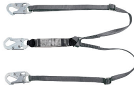
Reg. $119.99 Reg. $89.99 Twin 6' Std snap Hook