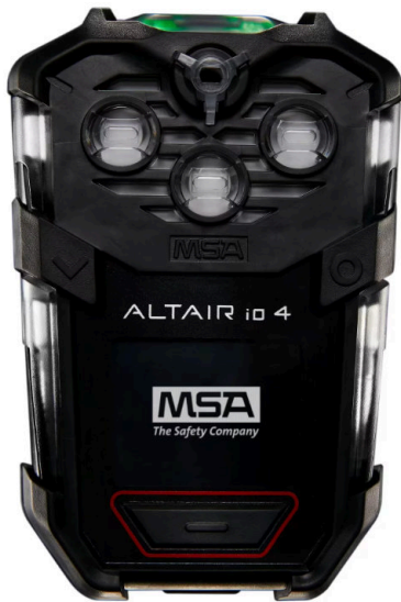
Reg. $1,799 Reg. $1,599 Altair io4 Gas Detector