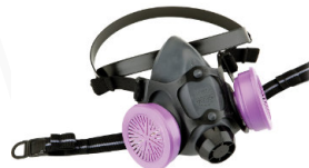
Reg. $19.99 SPECIAL $15.32 North 5500 Half Mask Size: Small, Medium and Large

Mod. 550030S - 90.105500301 550030M - 90.105500302 550030L - 90.105500303