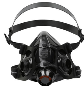
Reg. $39 SPECIAL $28.62 North 7700 Half Mask Size: Small, Medium and Large

Mod. 550030S - 90.105500301 550030M - 90.105500302 550030L - 90.105500303