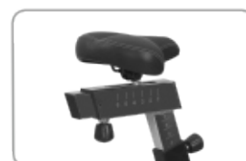
Dual adjustment seat