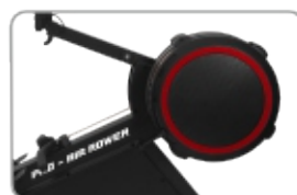
Air resistance flywheel