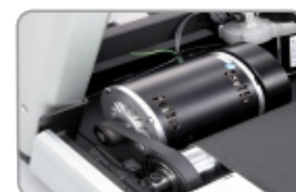
High Performance AC Motor System