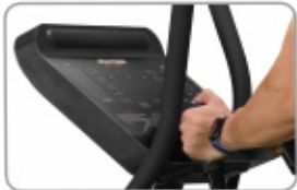
Resistance level control