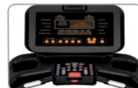
High Contrast Display