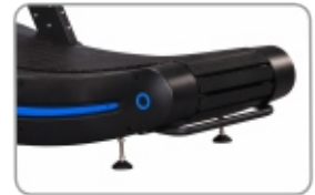
Slat belt design