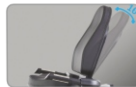
Recline adjustable Seatback