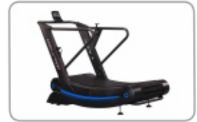
Compact and Heavy duty frame