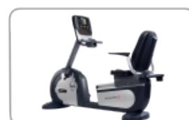
Walk through design