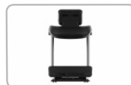
Compact and Heavy duty frame