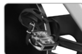
Pedal with toe clip strap