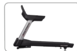
Compact and Heavy duty frame