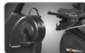
Easy strap & Walkthrough design