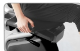
Resistance level control