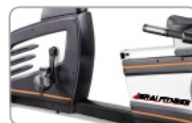
Walk through design optional