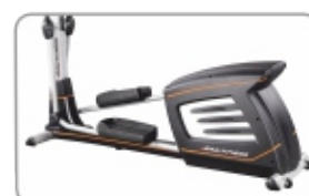
Rear flywheel drive