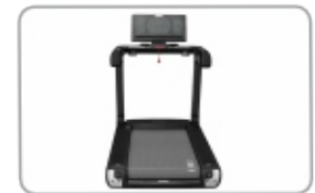
Compact and Heavy duty frame