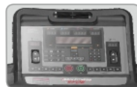
One touch Program