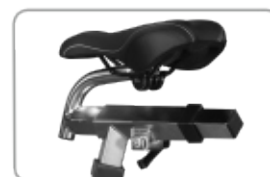
2 - Way adjustable seat