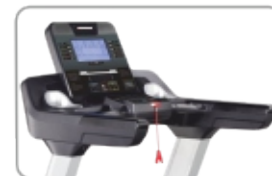
9" LCD - Blue backlight