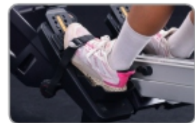
Adjustable foot strap