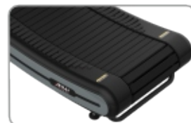
Slat belt design