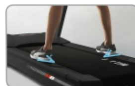
Angled side rail