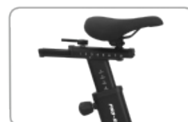
Dual adjustment seat