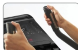
Resistance level control