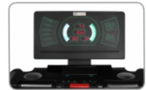
4 Window Display + LED Lights