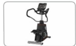
Compact and Heavy duty frame