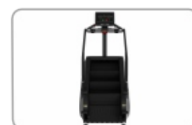
Compact and Heavy duty frame