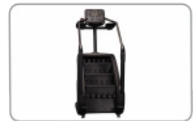
Compact and Heavy duty frame