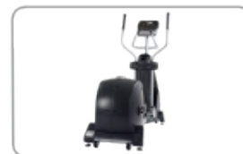
Compact and Heavy duty frame