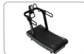
Compact and Heavy duty frame