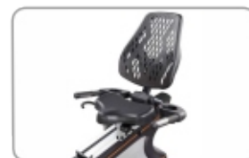
Seat adjustment 24 levels