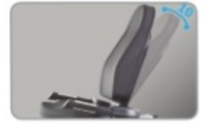
Recline adjustable Seatback