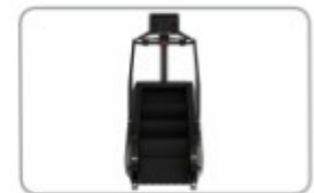
Compact and Heavy duty frame