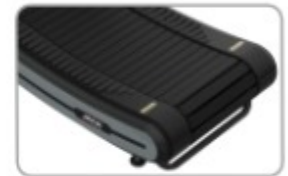
Slat belt design