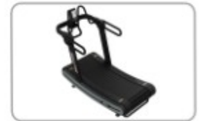
Compact and Heavy duty frame

Console Readout Display Type Power Requirement