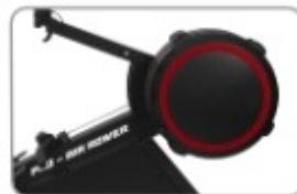
Air resistance flywheel