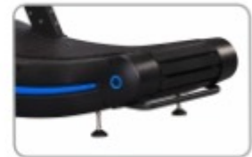
Slat belt design