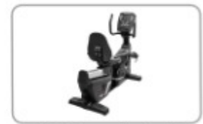
Walk through design