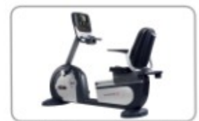
Walk through design