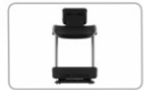
Compact and Heavy duty frame