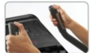
Resistance level control