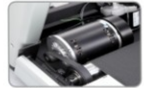
High Performance AC Motor System