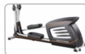
Rear flywheel drive