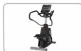
Compact and Heavy duty frame