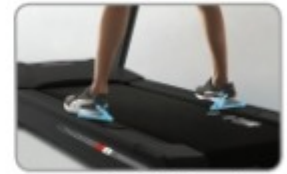
Angled side rail