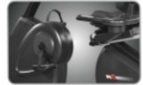
Easy strap & Walkthrough design