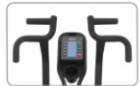
Multiple grips handle