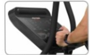
Resistance level control