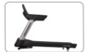
Compact and Heavy duty frame