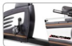
Walk through design optional