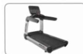
Compact and Heavy duty frame