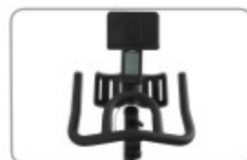
Multiple grips handle