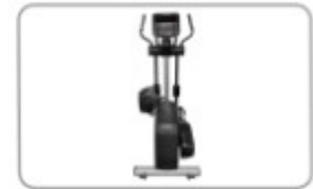
Compact and Heavy duty frame