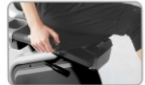
Resistance level control