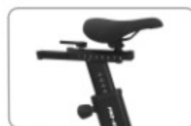
Dual adjustment seat