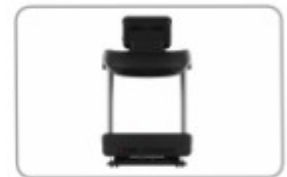
Compact and Heavy duty frame