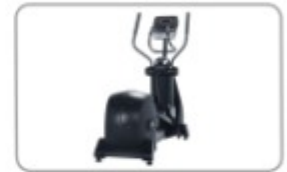
Compact and Heavy duty frame