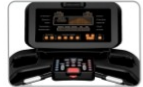
High Contrast Display