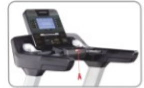
9" LCD - Blue backlight