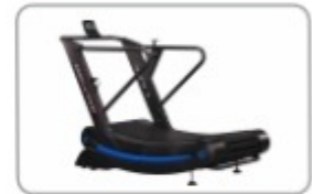
Compact and Heavy duty frame