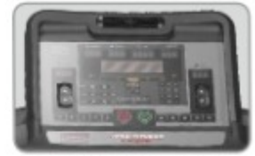
One touch Program