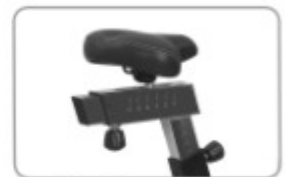
Multi adjustable seat