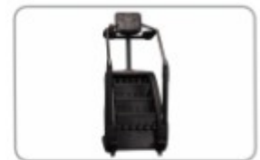
Compact and Heavy duty frame