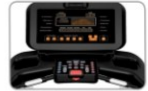
High Contrast Display