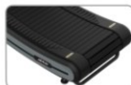
Slat belt design