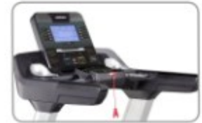
9" LCD - Blue backlight