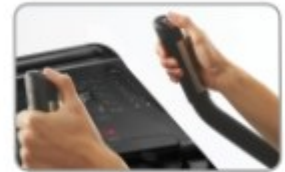
Resistance level control