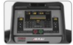
One touch Program