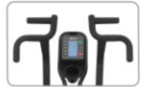
Multiple grips handle