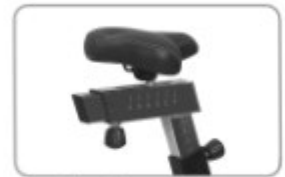
Multi adjustable seat