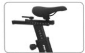
Dual adjustment seat