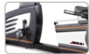
Walk through design optional