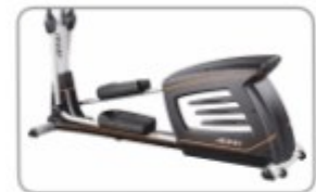
Rear flywheel drive