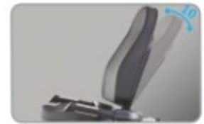
Recline adjustable Seatback