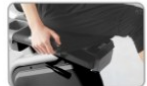
Resistance level control