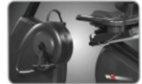
Easy strap & Walkthrough design