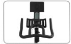
Multiple grips handle