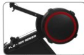
Air resistance flywheel