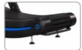
Slat belt design