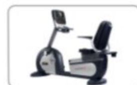
Walk through design