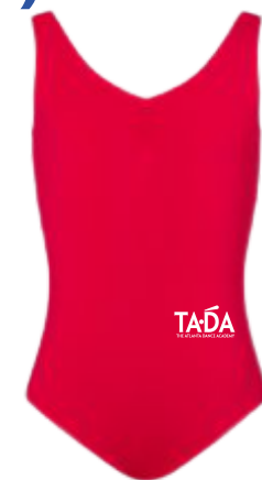
CL04 (child) or AL04 (adult) in Red