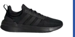
Hip-Hop & Positive Motion