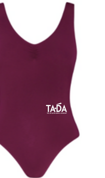
CL04 (child or AL04 adult)