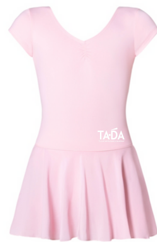
CL07 Ballet Pink