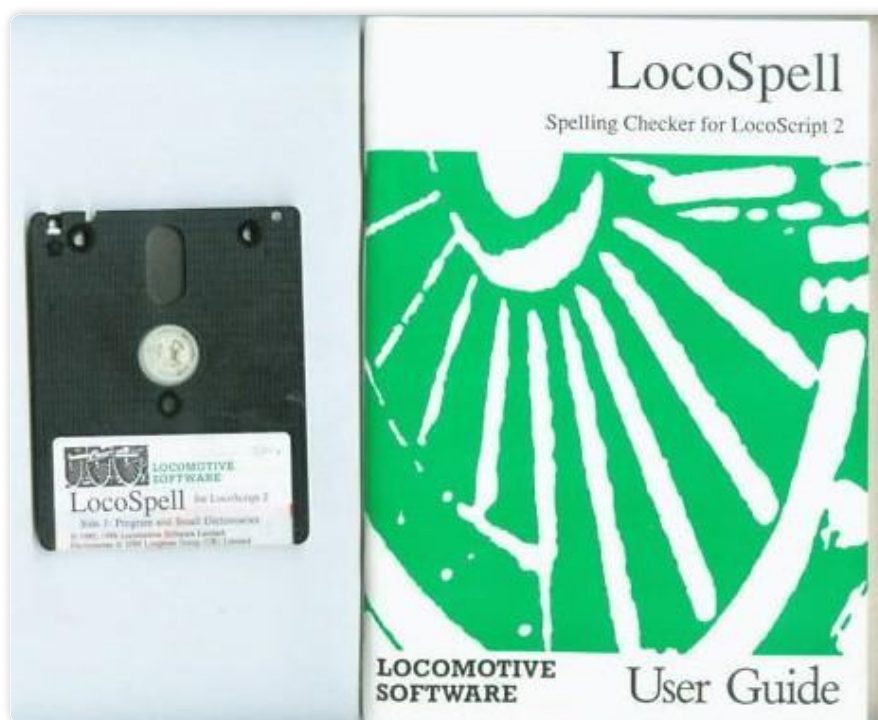
Graphic: The early days of spell checkers looked very similar to the early days of ChatGPT

In the 1980s, we had to purchase spell check software on a floppy disk, install this on our computers, write our document on a word processor, copy and paste into the spell check software, then copy and paste the results back into our word processor. Sound familiar? Companies everywhere are clamoring to build their own ChatGPT-like chatbots, but ChatGPT is as primitive as this interface will ever be. Moving forward, this feature will be baked right into the applications we use daily such as Gmail, Word, etc. Just as we find it odd to use an application without a spell check built in, so too will it feel weird to interact with an application that doesn't understand us speaking to it in ordinary language, or to not help predict what we're going to type next.