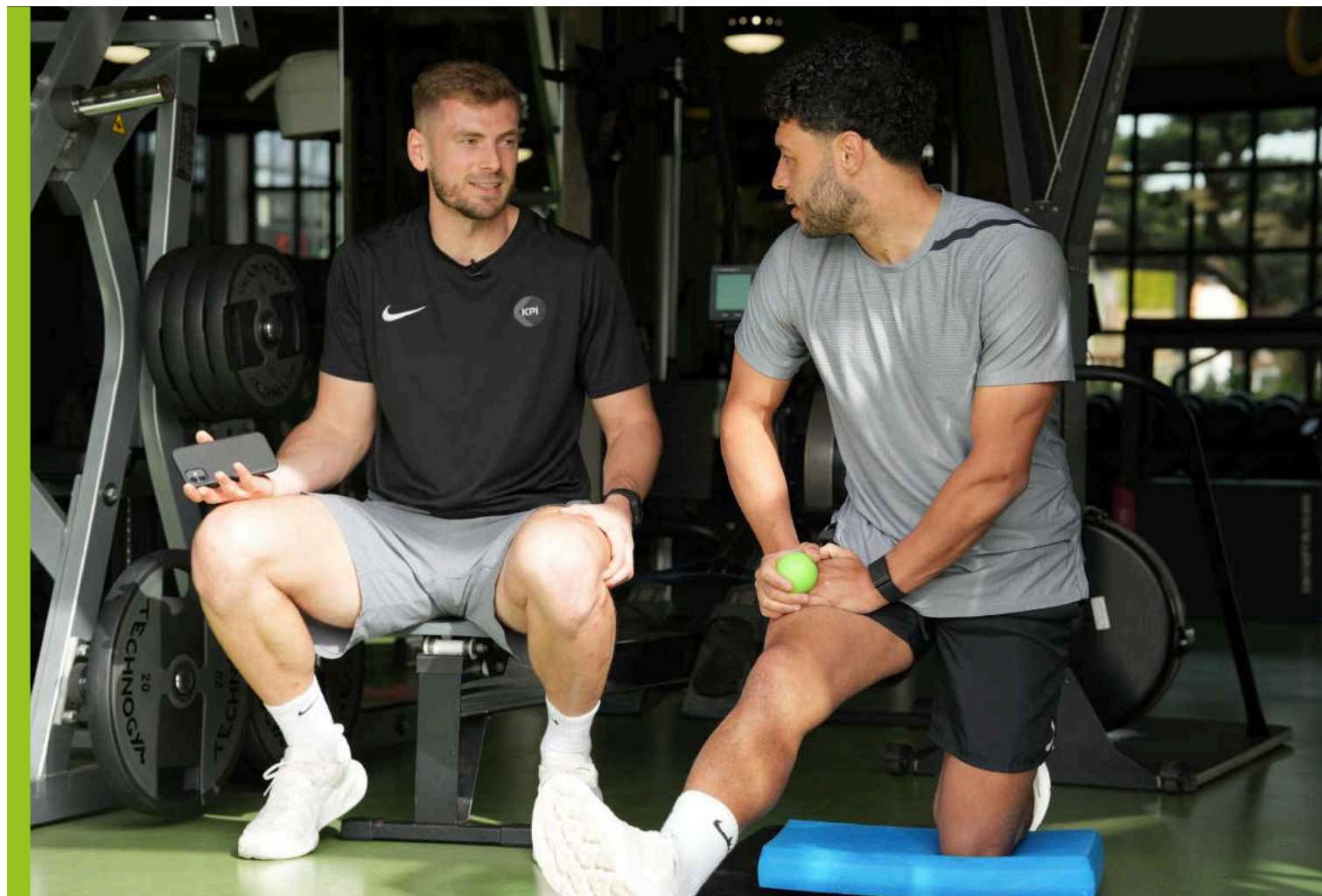
Alex Oxlade-Chamberlain Celtic

Trusted By Athletes Competing At The Highest Level