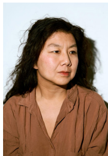
图片致谢艺术家 Courtesy of the artist