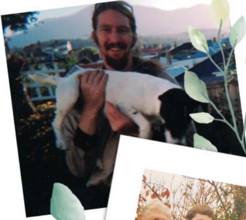
1996 In Hobart