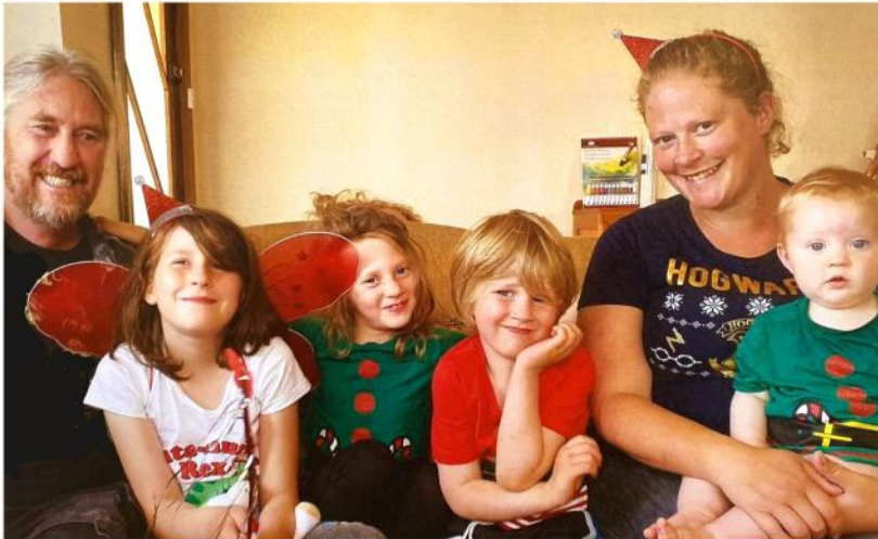
Christmas Day - 2019