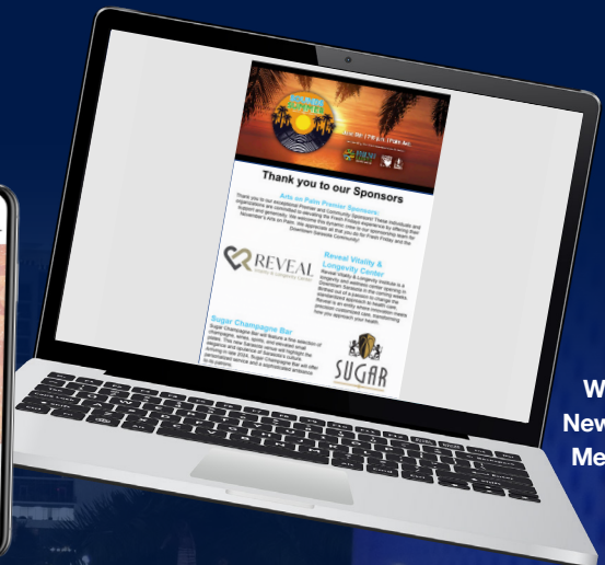
Weekly Newsletter Mentions