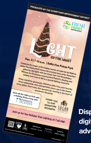
Displayed on all digital and print advertisements