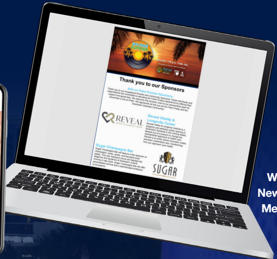
Weekly Newsletter Mentions