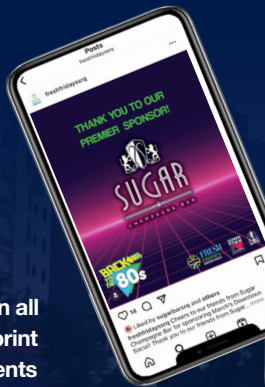
Dedicated monthly social posts