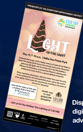
Displayed on all digital and print advertisements