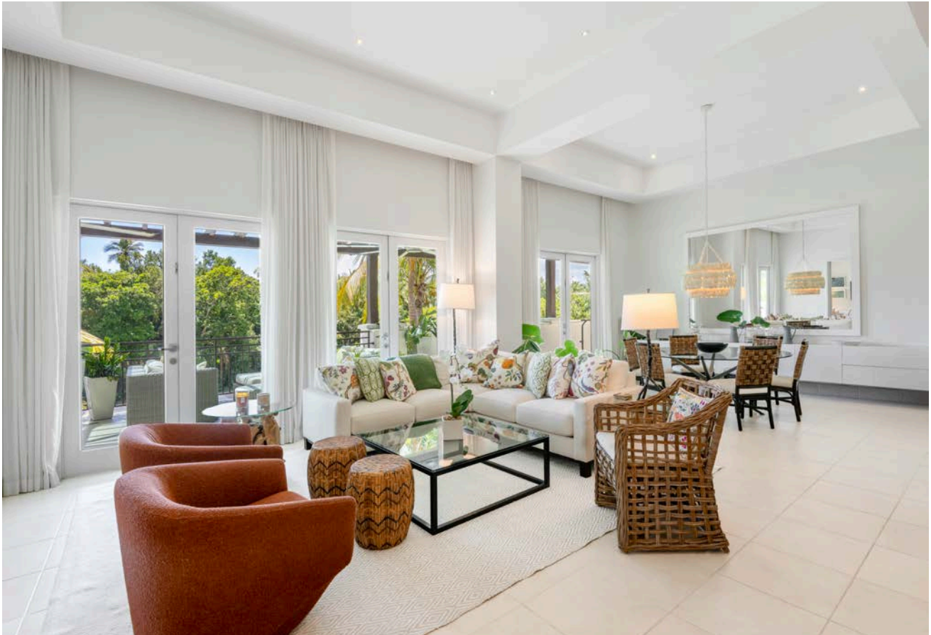
Living / Dining Area