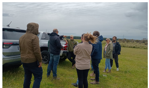
Above: Project site visit with members of the Melaythenner Teeackana Warrana Aboriginal Corporation (MTWAC) and the Aboriginal Elders Council of Tasmania.

In the spirit of reconciliation, Equis seeks to co-design meaningful opportunities with Tasmanian Aboriginal people and looks forward to working together collaboratively to maximise benefits from the project.